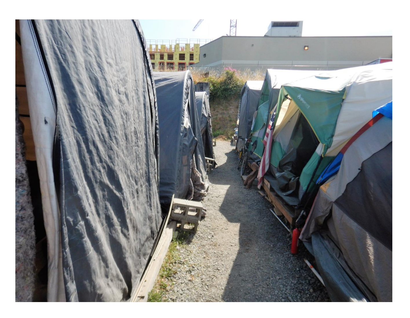
Tent City 5

Item No. <u>3b attach 2</u> Meeting Date: <u>August 8, 2017</u>